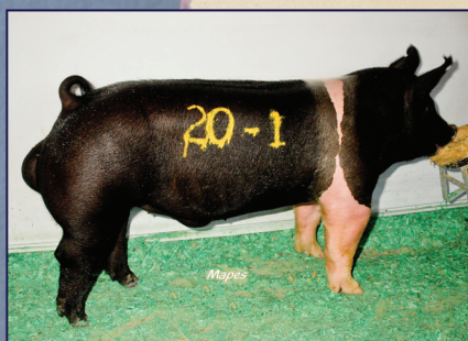
Champion Hampshire Boar EXHIBITED BY HEIMER HAMPSHIRE